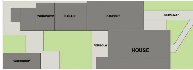
DELPRAT AVENUE BERESFIELD